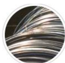
Wire Rod For the production of reinforcing mesh & other applications including wire drawing.