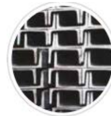
Channels, Parallel, Tapered Flange & UPN Typically used in composite steel construction.