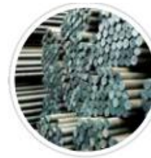
Plain round bars With various applications including construction.