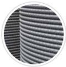
High Yield Coils For the reinforcement of concrete (Grade 500C)