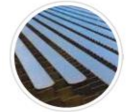
Flat bars With various applications including construction, transport and machinery.