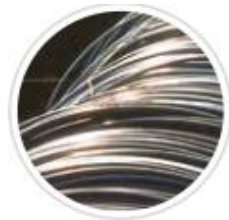
Wire Rod For the production of reinforcing mesh & other applications including wire drawing.