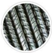
Reinforcing bars For the reinforcement of concrete (Grade 500C)