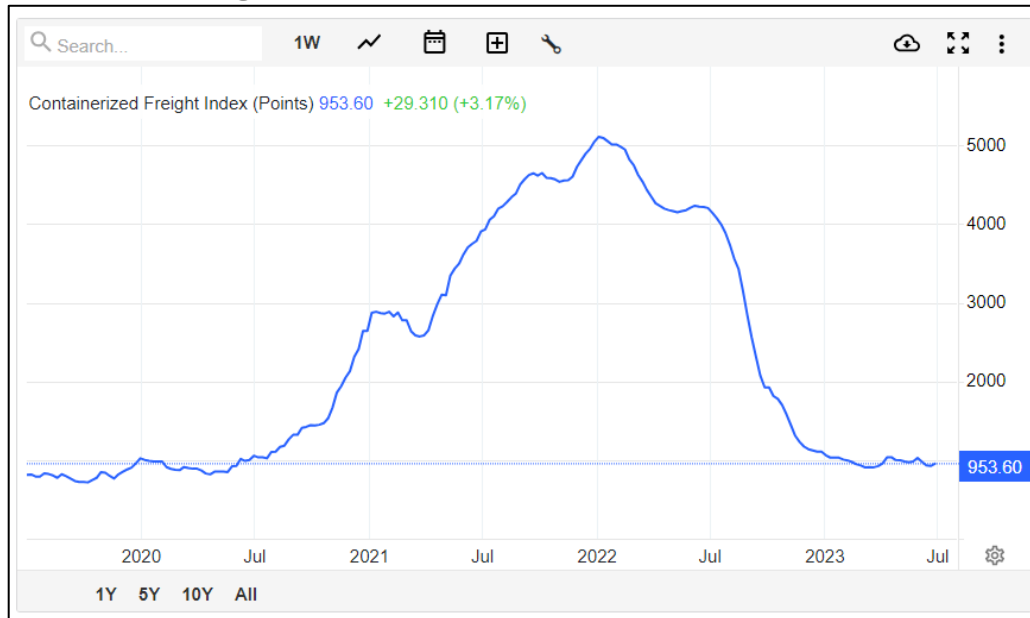
Figure 2 – Container freight index

Second, as Figure 2 demonstrates, 5 container freight costs were elevated during much of the injury period.