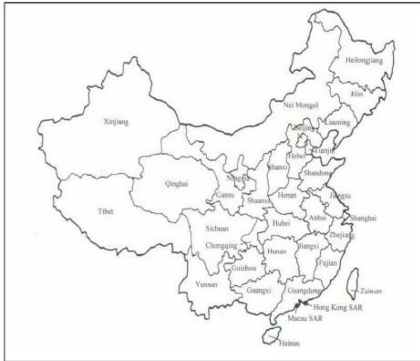
Figure 2a: China's provincial map

Migrants tend to concentrate in large cities. Using census and hukou data, the author has estimated that about half of the population in the four first-tier megacities (Shanghai, Beijing, Guangzhou, and Shenzhen) were migrants in 2020. Detailed, systematic data from the 2010 census also show that 44 percent of the population in cities with over 5 million people were migrants; three-fourths of them held a rural hukou and were thus predominately rural-to-urban migrants (Chan and Yang 2019; Zhao 2014). Women made up 47 percent of all migrants in 2010 and men accounted for 56 percent of long-distance migrants crossing provincial boundaries (Deng 2014).